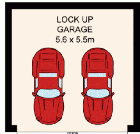
LOCK UP GARAGE 5.6 x 5.5m