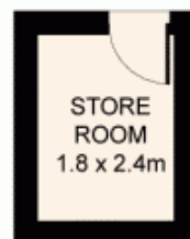
STORE ROOM 1.8 x 2.4m